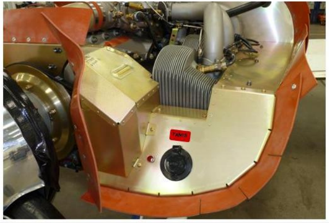
Figure 2 - SR22/SR22T Shore power plug located in left front engine baffle. Plug for the SR20 (not shown), is located in same area on horizontal surface of baffle.